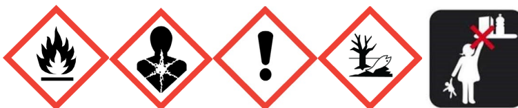
Flame Health Hazard Irritant Aquatic Hazard Keep away from children

Conforms to OSHA 29 CFR 1910.1200 and aligns to the United Nations Globally Harmonized System